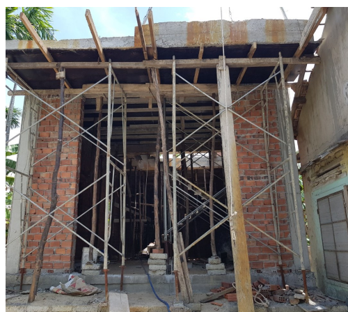
New house is on progress