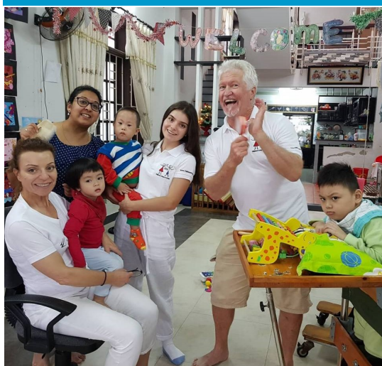
With the POD children

I had backpacked in Vietnam some years ago so was pleased to be able to re-visit Hoi An. On this occasion my experience was a snapshot of living a bit like a local. My commute was a brief minute walk avoiding or should I say striding confidently through speedy motorbikes. Over time I grew to relish any journeys I could hitch a ride on. These included rides loaded with children, or clothes and boots for those in the village, or all at the same time! Walking around barefoot in the office is a little different to the corporate high-rise air-conditioned building of my London base. As CHIA was handy to my accommodation, I purchased a rather unattractive but essential poncho for the rainy weather. I was just like everyone else. Of course it would be shed as soon as entering the clean and dry office!