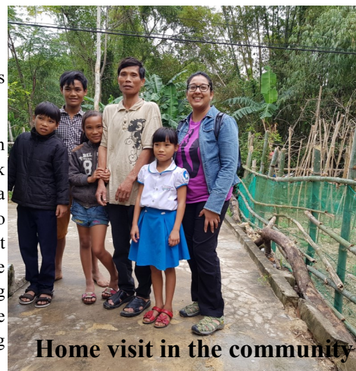
Home visit in the community

So what brought me to Hoi An? Well I'm a Chartered Accountant by trade, and had been seeking an opportunity to volunteer my finance skills abroad. I was able to obtain a 2 week assignment with CHIA through Accounting for International Development (AFID). It is a UK based Social Enterprise that places volunteer accountants with NGO's or charities to enhance their financial capacity in a sustainable manner. Often local skills are lacking and it is very expensive for a small organization. The reporting requirements of their donors are complex and may require additional support. CHIA has benefited from prior accounting support from AFID. On review of systems and processes implemented previously, my role was to then provide further guidance and mitigate queries, as well as support on budgeting and the future strategy of the charity.