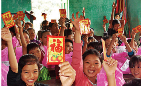
Smiling faces with their Lixi