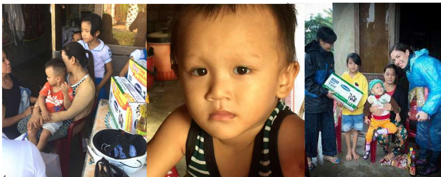
CHIA visited this family to provide vital nutrition and support.

CHIA will continue to support this family which will help the children and mother and will reduce the fear, pain and financial burden they face. The children will have an opportunity to learn and have a better chance of getting a good paying job in the future. CHIA looks forward to helping many other disadvantaged children by finding generous donors to provide nutrition sponsorships, providing hope for the people of Quang Nam province.