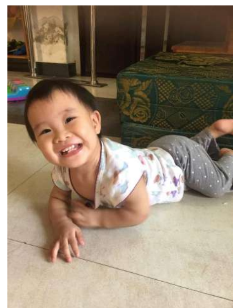
Chi is a very happy child at CHIA, she has got a big personality and loves to play with the other children

POD program returned after TET holidays and is now running at full capacity. The children enjoyed their Spring break and their faces show happiness which makes the classroom come alive with fun.