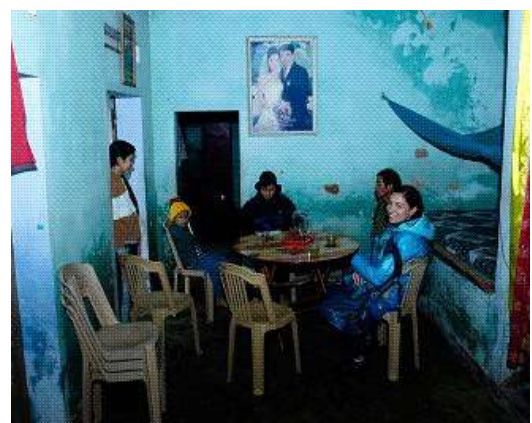
CHIA visited the boy at his home in Thang Binh District