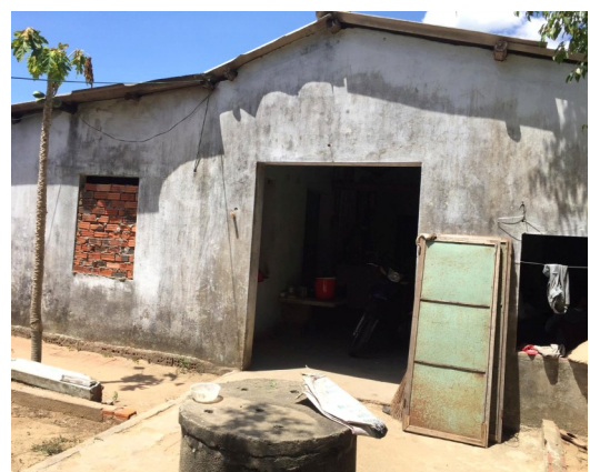
CHIA visited the girls at their home in Duy Xuyen District