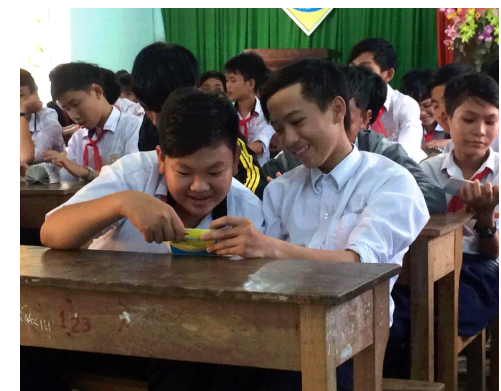
Looking at Sexual Booklet