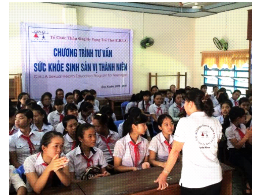
Separate workshop for male & female

Through this article, we hope that more people will help us to continue to pursue this meaningful work. We hope to reduce the number of the abortion rate and improve the health of our youth and community.