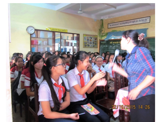
Question and answer with midwife educator