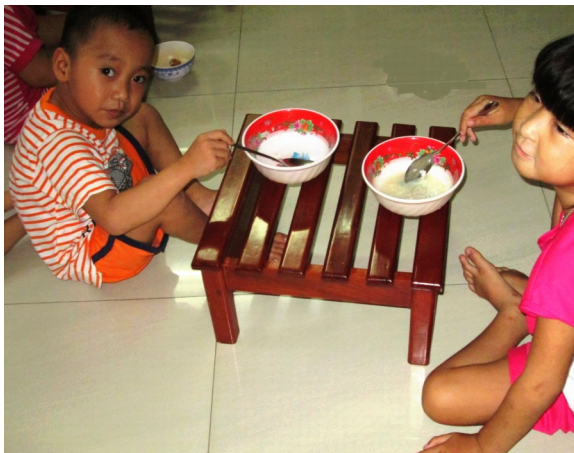
Learning to be independent with daily tasks

I feel blessed to have had the opportunity to work at CHIA's POD (Program of Development) program the past few months as a volunteer Occupational Therapist (OT). It was a great learning experience and one that was most cherished and rewarding. The rewards were the children's beautiful smiles. My clinical background has been primarily working with adults and older adults in Canada, and only minimal volunteer experience with this population. I was therefore quite anxious before starting and uncertain how I may contribute. Luckily, the previous volunteer OT provided some information ahead of time and the team was extremely helpful and supporting.