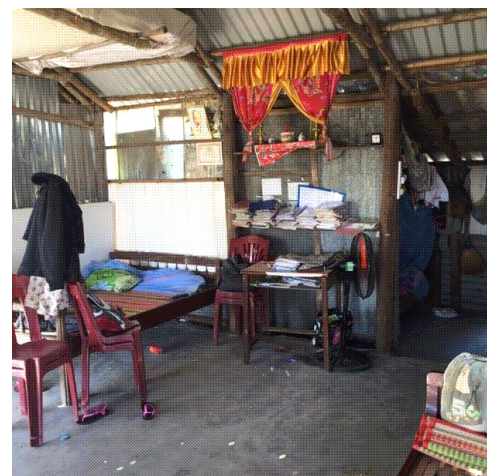
Ngoc's study corner