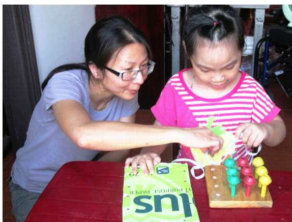
Practice lacing and hand therapy

My goal at POD was to play a supporting role to the existing program and provided complimentary therapy. As POD already have a good physical therapy program in place for each child, a focus on daily activities with the kids was needed. Feeding time at first was a struggle but with proper set up and re-enforcement from the whole team, half of our children can now feed themselves independently. Shower and toileting also became a daily 1:1 therapy time. In fact every interaction became an opportunity for play, teaching / learning and for stimulating their beautiful minds and body. I am very excited to share that half of the children learned to dress, undress and use the commode on their own or at times with minimal supervision or assistance. It is quite an achievement for the children and our team within such a short time. Hip Hip Hooray!!!