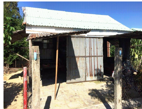
Outside of the house